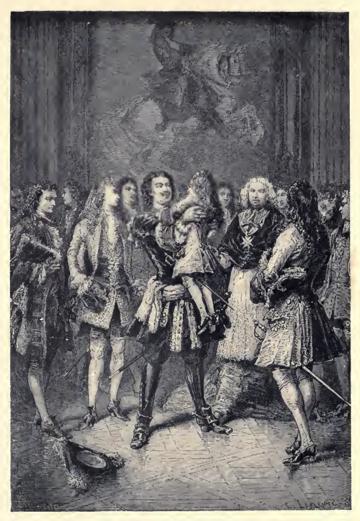
PETER THE GREAT AND LITTLE LOUIS XV. France, Frontispiece, vol. five.